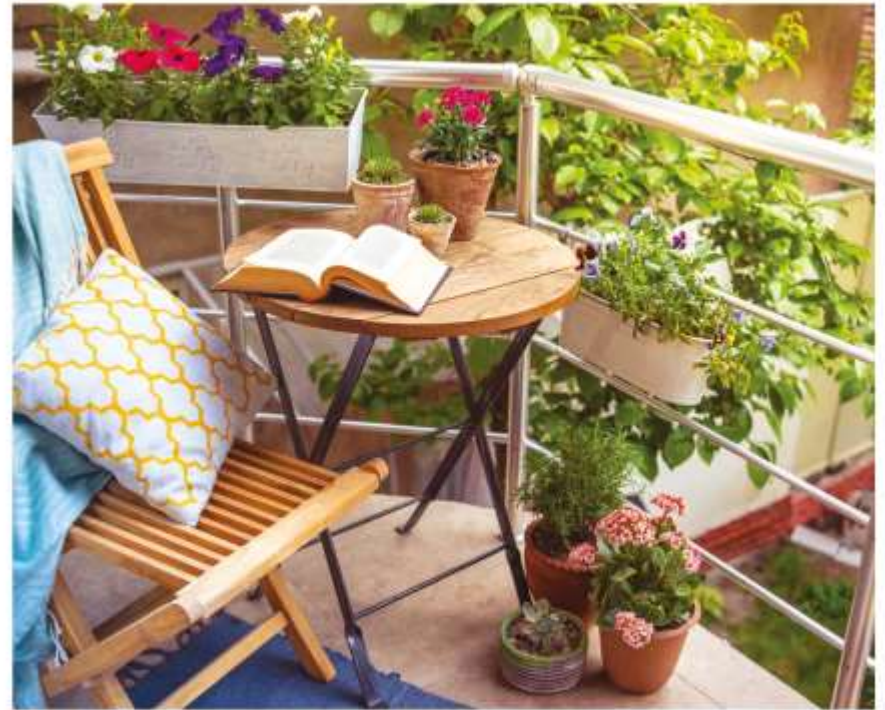
The image shows a balcony with a wooden chair, a table, and potted plants.