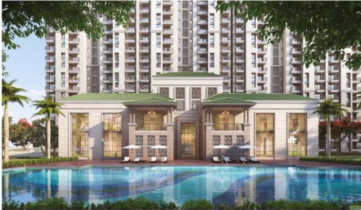
THE HAPPY TRAILS IS AN AFFORDABLE LUXURY HOUSING PROJECT IN GURGAON