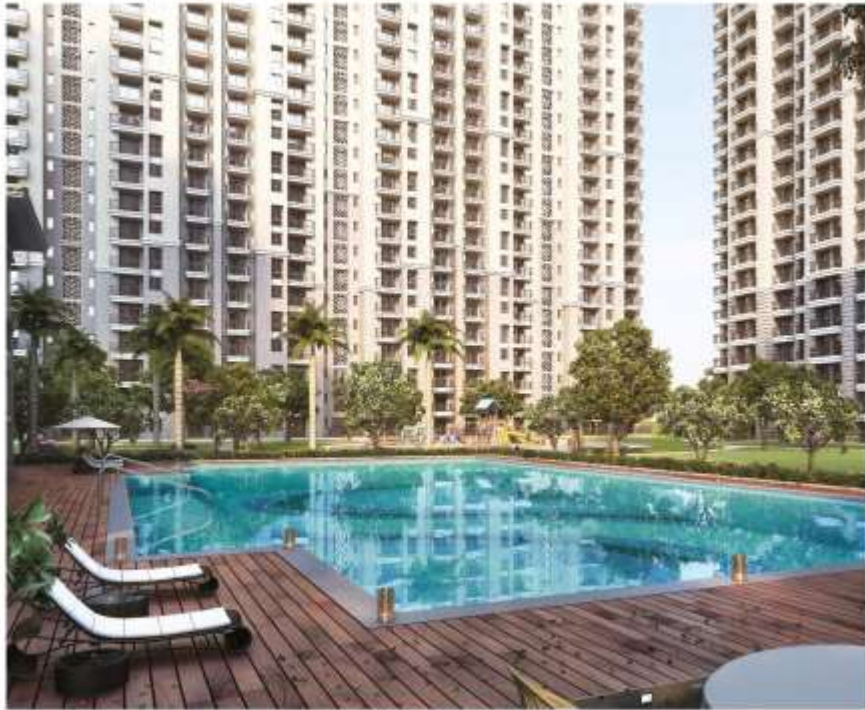
The image shows a large swimming pool in a modern apartment complex.