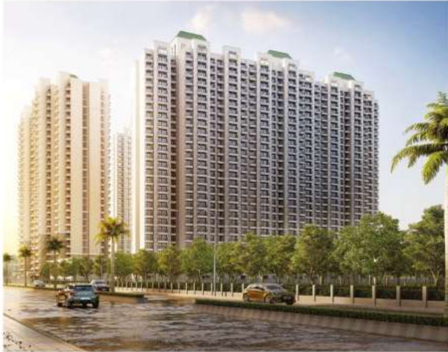
The image shown is for illustrative purposes only and is not to scale.