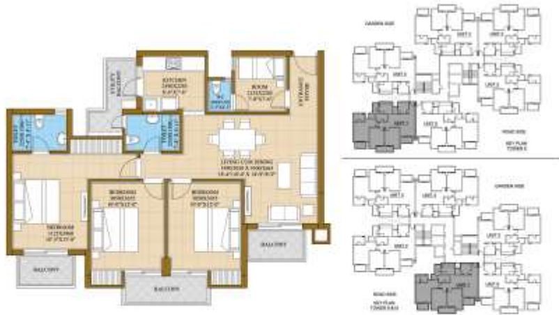
Type B - Typical Floor Unit

Seivable Area: 2607 sq. mt. 30.00 sq. mt. (Built-up Area) + 30.00 sq. mt. (Common Circulation + Services) Carpet Area: 60.50 sq. mt.