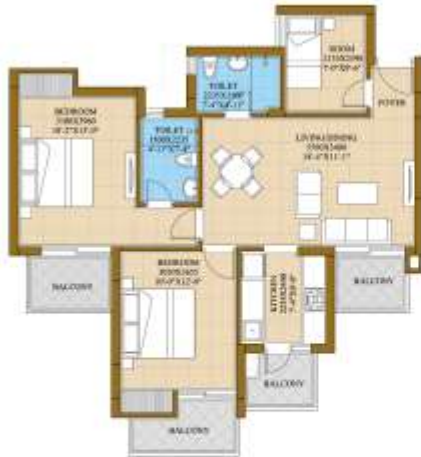
Type C - Typical Floor Unit